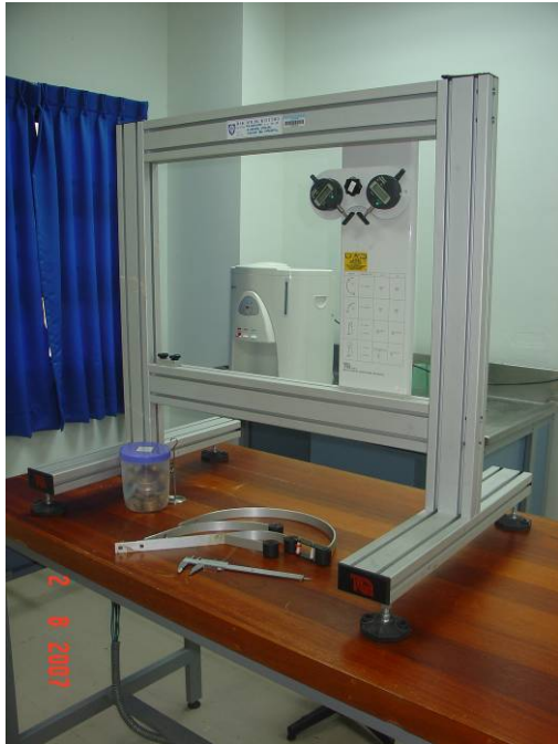
THIN CYLINDER APPARATUS