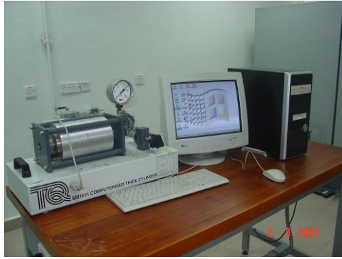
THICK CYLINDER APPARATUS